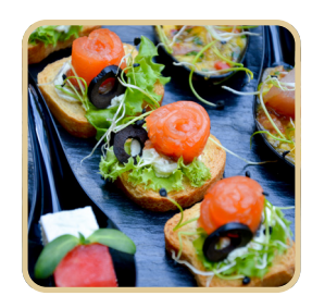
CATERING & BEVERAGE