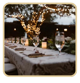
PRIVATE EVENTS & FUNCTIONS