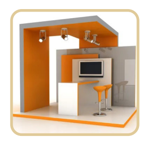
EXHIBITION DESIGN & BUILD