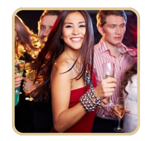
SOCIAL EVENTS & PARTIES