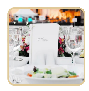
AWARDS & DINNERS