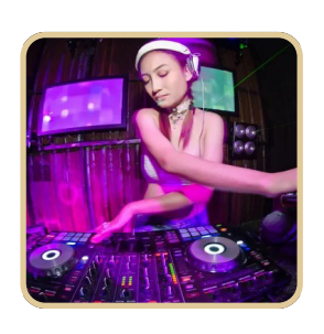
ENTERTAINMENT DJ'S & MUSICIANS