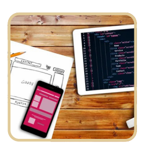
EVENT PLANNING & DESIGN